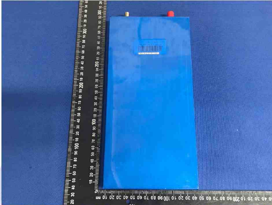
Photo 1 Front 正面